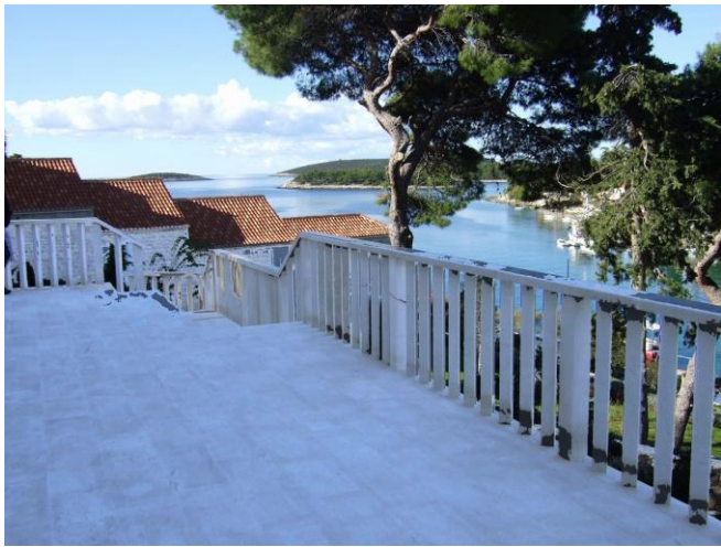
View from Ground Floor Terrace looking South West