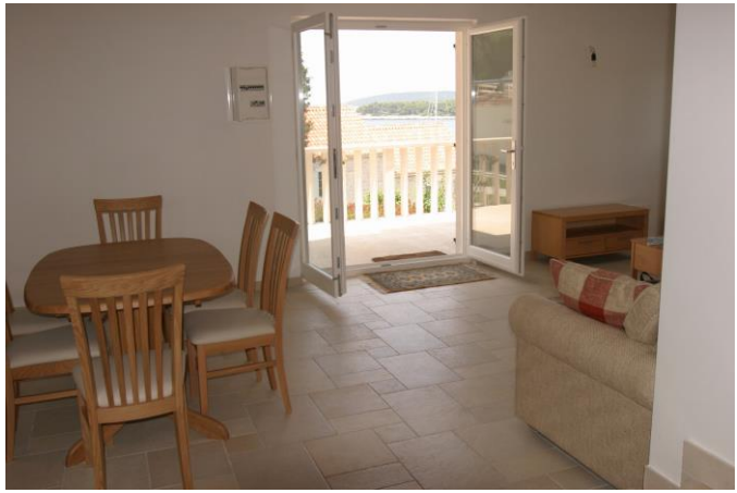
Typical Dining & Living Areas