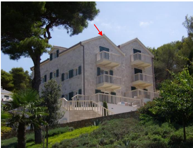
Frontal View – North Block