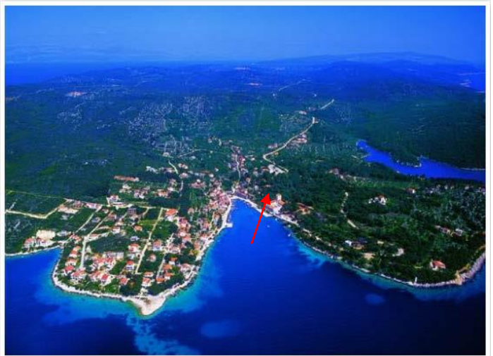
Maslinica Village – View to East