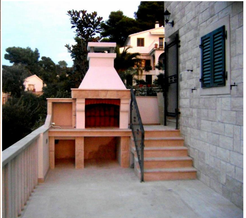
Traditional Croatian Wood Fired Barbeque on large 11 metre terrace