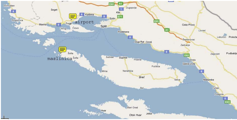
Maslinica Solta – 12 miles South of Split Airport