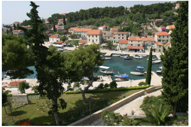
View from Ground Floor Terrace towards North (fishing village)