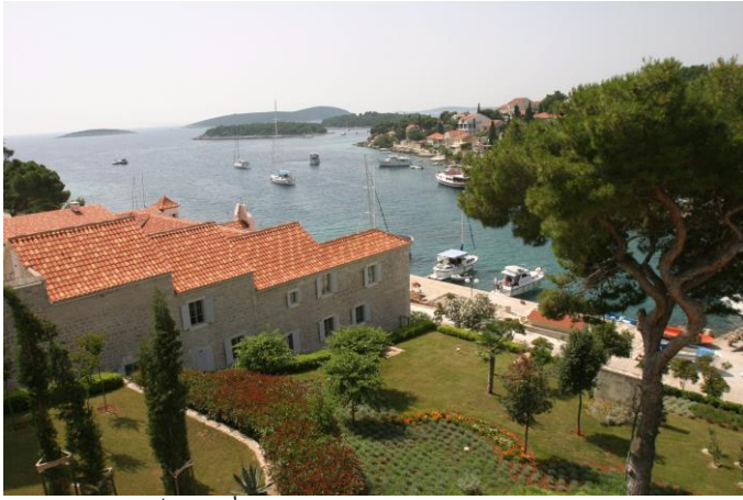
View from 1 st & 2 nd Floor Balconies towards South West