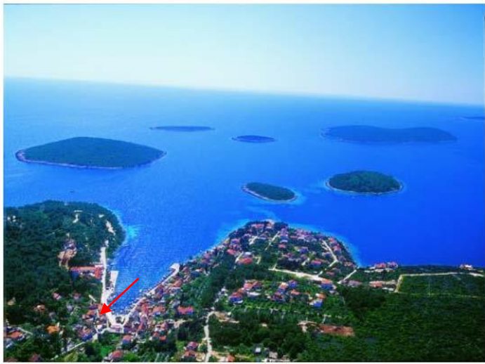
Maslinica Village – View to West (Bella at Red Arrow)