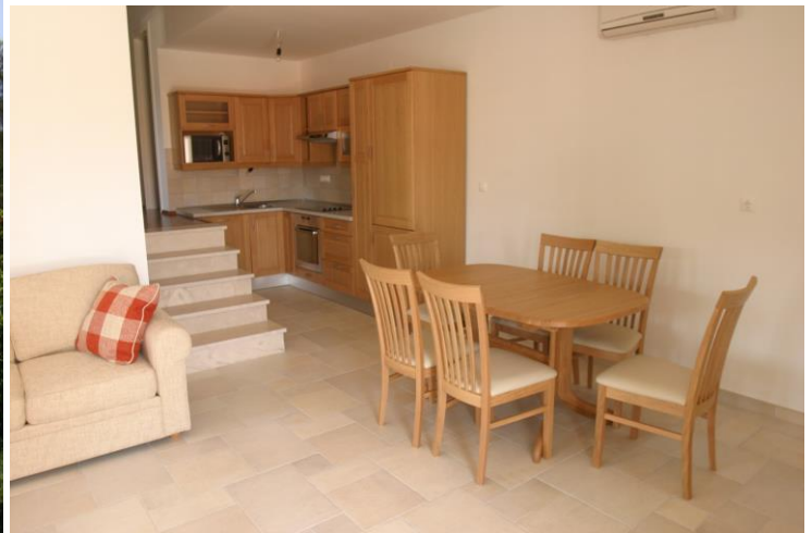
Typical Kitchen & Dining Areas