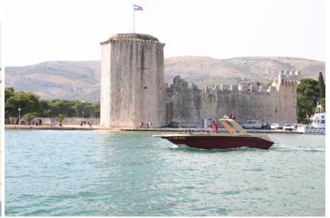
Speedboat Transfer from Split Airport