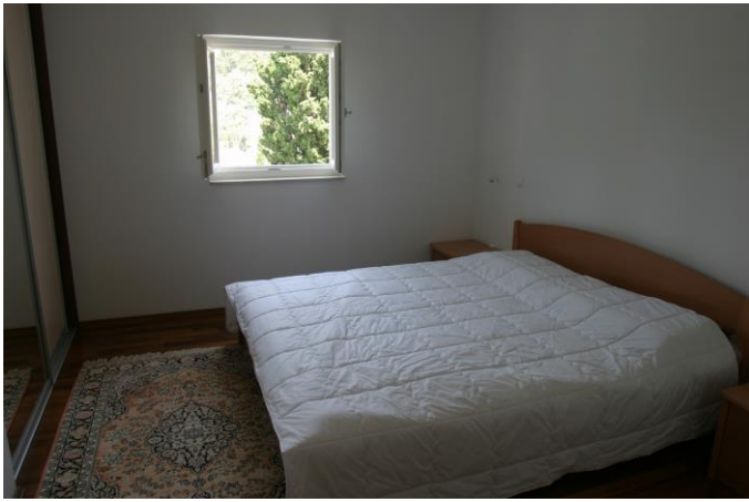
Typical Double Bedroom with views to harbour