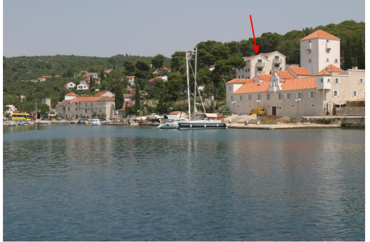
Panoramic View showing Bella behind castle